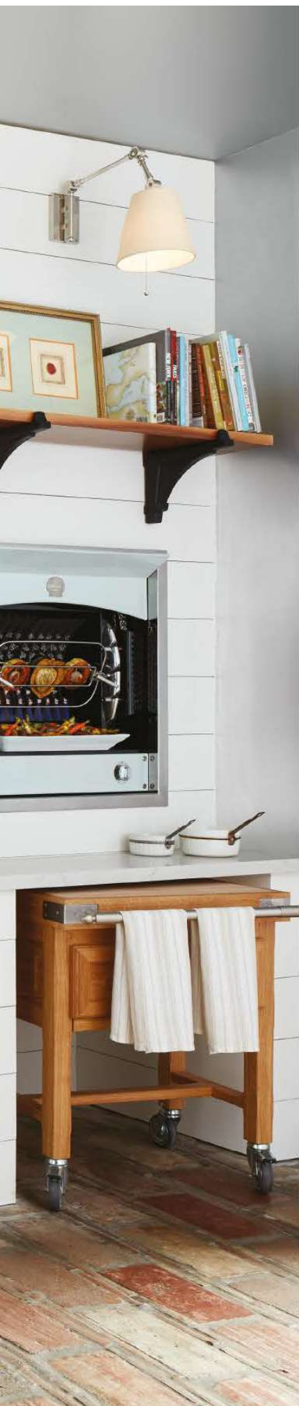
Château 150, flamberge rotisserie and cabinetry, USA.