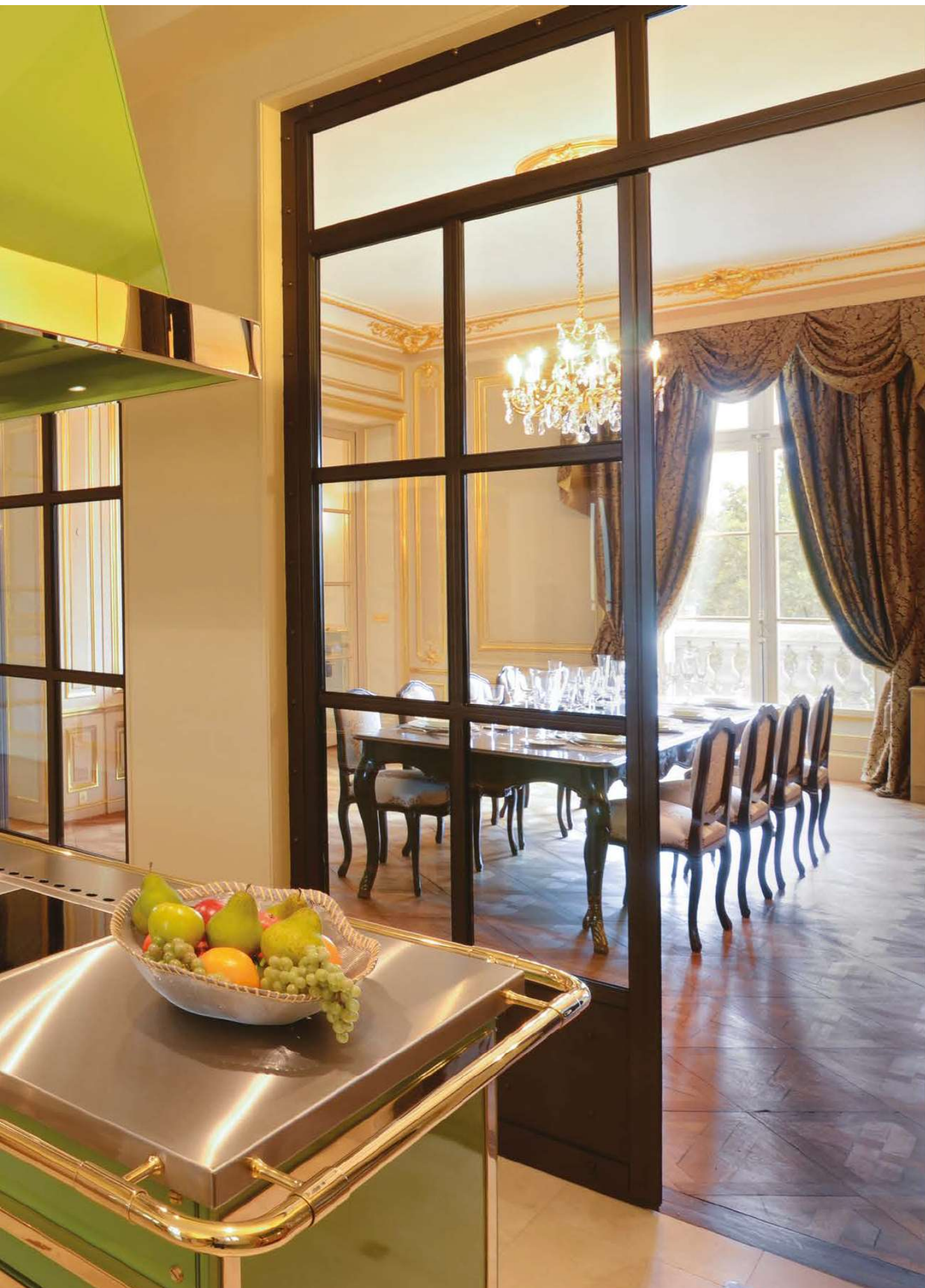
Central island with Chateau 165, USA.