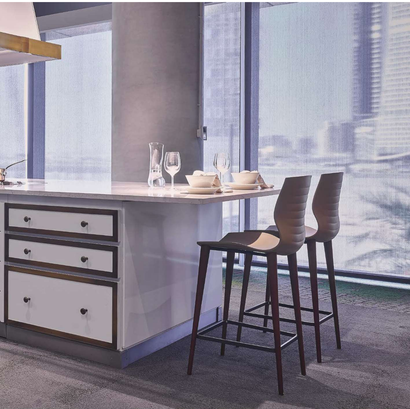
Central kitchen island, Dubai.

Excellence: n. Characterising that which corresponds, almost perfectly, to the ideal representation of its function or which demonstrates clear superiority in its field.